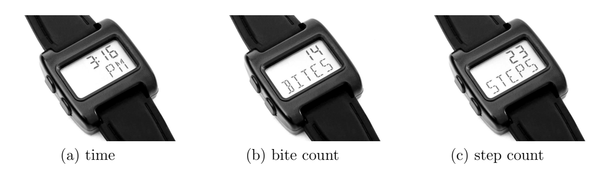
Figure 1: The main displays shown by the ELMM.

• If the display reads SLEEP press any button to awaken. The device goes to sleep to conserve power if it remains immobile for a full day.